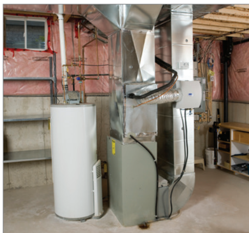
Typical furnace and water tank installation takes up to about 25 square feet of floor space.

The RedZone™ DVS Air Handler is the only system available that can use either standard or three-inch diameter ducts.