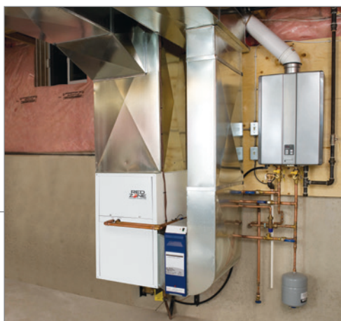
Neat, compact installation can be wall mounted.

Tankless hot water combo heating is a new and exciting hot water, home heat option. It offers some excellent advantages including: high efficiency, lower operating costs, simplified, cost-effective installation and gentle heat that's less dry than typical forced-air. However, some questions still remain: