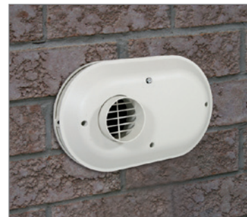
Typical low profile sidewall vent is an excellent choice for townhouses.