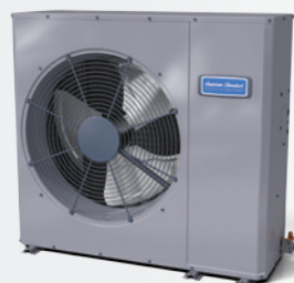
Silver 16 Low Profile